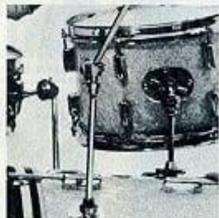
SWIV-O-MATIC drum attachments...new freedom for drummers

Set 'em up once and THEY STAY PUT , for an evening or a year!